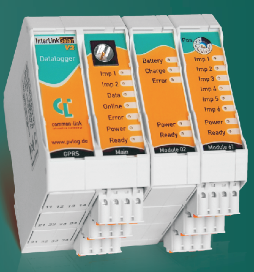
InterLink-Solar V2 GPRS with expansion module and emergency power supply unit

The InterLink-Solar system provides all the tasks required to monitor PV installations from a single source, regardless of inverter type or plant size.